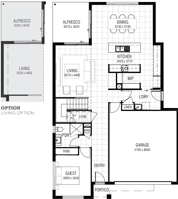
OPTION LIVING OPTION